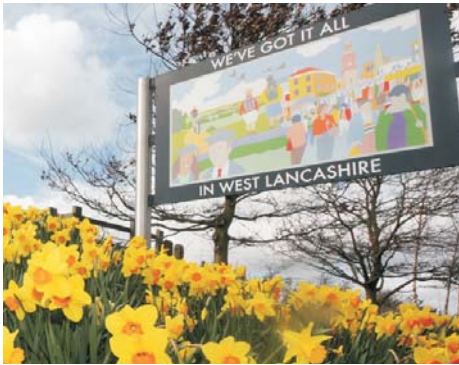
West Lancashire Borough Council